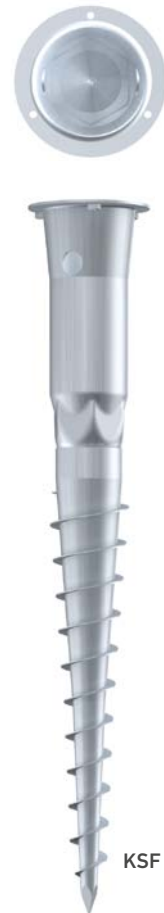
KSF E 89x800-E60