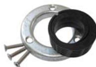
Excenter Set-E60 Item No. 24817