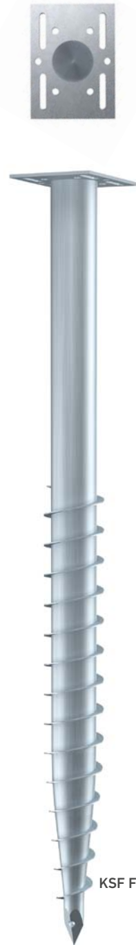
KSF F 76x1300-R