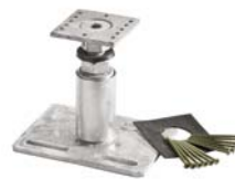
Post Bearer Vario PS150-R Item No. 28019