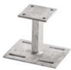
Post Bearer Plane-R Item No. 28006