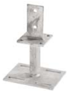
Post Bearer Sword-R Item No. 28009