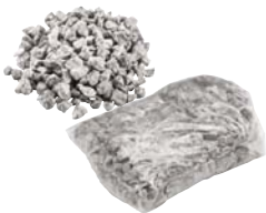
Special Granulate 1500 g Item No. 21824