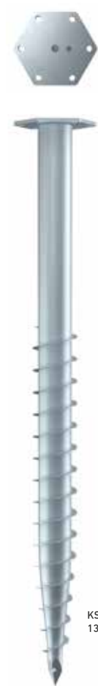
KSF M 76x 1300-M16